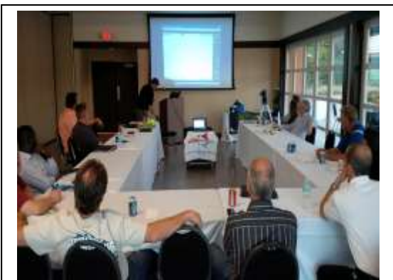
Members listened to a great presentation, enjoyed an excellent BBQ dinner, and networked during the regional meeting.