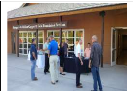
WCPA Members and guests arrive at the Phoenix Zoo, Neely Center on May 7, 2014 for the WCPA Regional Meeting.