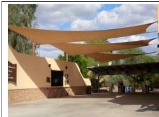
The WCPA Regional Meeting tallied about 20 registrations. In all 15 people attended the event at the Phoenix Zoo.